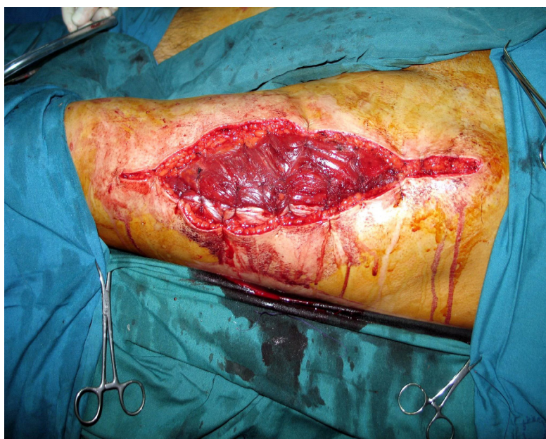
Figure 3. This figure shows post resection defect of the left thigh (July 2007).

The metastasis rate in papillary meningioma has been reported to be 20%. Different kinds of metastatic formation have been documented for malignant meningioma. Those