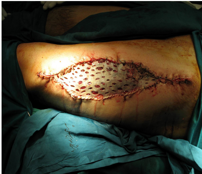
Figure 2. Reconstruction by performing a split thickness graft from the other thigh (July 2007).