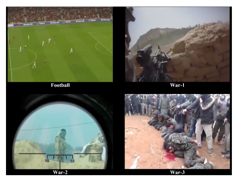
Figure 1. Sample screenshots of the presented videos

The paradigm lasted 11:55 minutes. It comprised 6 rest conditions (24s each), 3 football conditions (30s each), 3 videos of war-1 condition (30-50s each), 2 videos of war-2 condition (30s each), and 5 videos of war-3 condition (34-60s each). The conditions were initially randomly distributed; then, the same paradigm was presented to all study participants. The videos and their sounds were presented to the research participants during the MRI scan using a goggle ( 800 \times 600 -pixel resolution in a 0.25 square area and refresh rate of up to 85 Hz) and an earphone (30 dB noise-attenuating headset with 40Hz to 40 kHz frequency response), i.e. appropriate to up to 4.7T magnetic fields (VisuaStim, The Pennsylvania State University, USA).