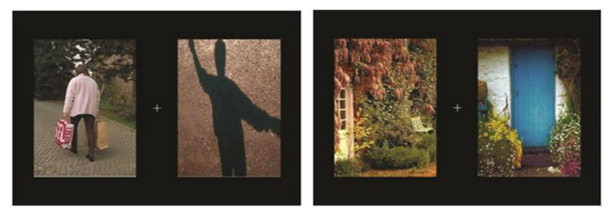
Figure 1. Two samples of study slides. (a): Painful-neutral; (b): Neutral-neutral