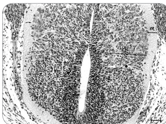
Figure 2. Micrograph showing a horizontal section of spinal cord in embryos of mercuric chloride treated rats. H&E staining. \times 400 . Bar:100 \mu . Note the nuclear disarrangement, cell death and increased extracellular space. V: ventricular zone; M: mantle zone; m: marginal zone : Arrow shows cell death and strike shows extracellular space.