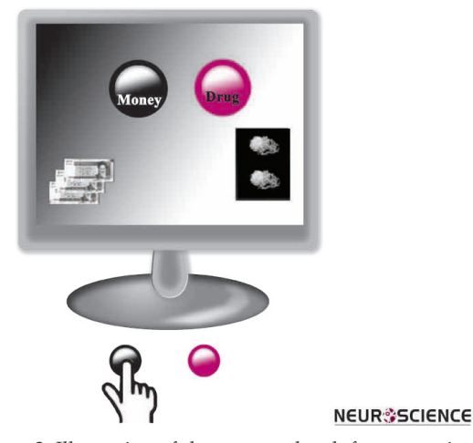
Figure 3. Illustration of the proposed task for measuring the reinforcing efficacy of methamphetamine.

is insensitive to the dose of the drug. To increase the sensitivity of the responses to the value of the drug, we suggest using the second variant of the choice task. That is, a PR should be completed before access to the drug or money. We predict that involvement of a PR to the task increases its sensitivity to the reinforcing efficacy of the drug, and hence, with an increase in the drug dose, the breakpoint of the PR schedule for methamphetamine increases, and the breakpoint of the PR schedule for the money decreases (Figure 2). The outline of the task can be as follows.