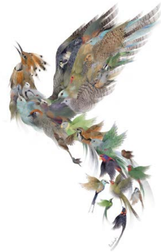
Figure 3. Simorgh sketched by Hamidreza Bidaghi- Fajr Film Festival- Tehran- Iran.

“Your meaning is composed by all of your understandings”.