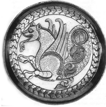
Figure 1. Simorgh sketched on coins during the kingdom of Yazdgerd III.