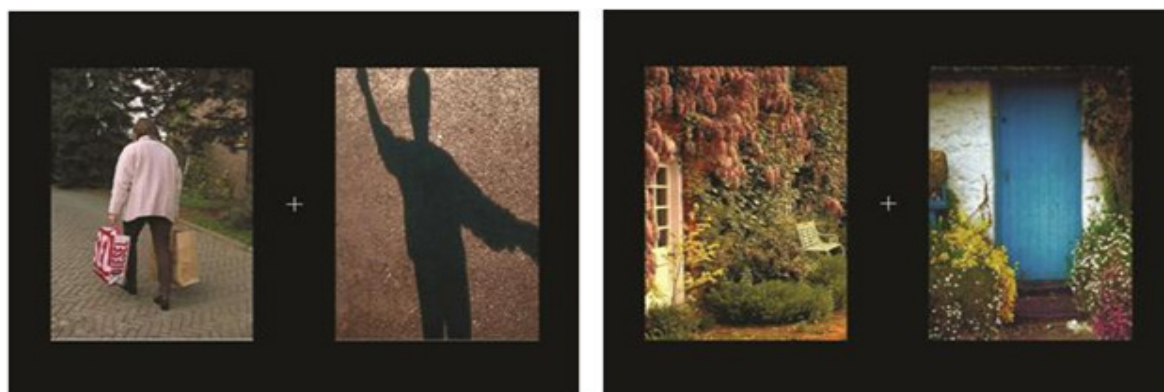
Figure 1. Two samples of study slides. (a): Painful-neutral; (b): Neutral-neutral

For the total number of fixations, there was a significant main effect of picture type ( F_{1,36}=69.47 , P<0.0001 , \eta^2=0.65 ) with most of fixations occurring on the painful images in both groups (painful: Mean=69.65, SD=15.99; neutral: Mean=47.76, SD=10.59). The main effect of group ( F_{1,36}=2.80 , P=0.1 ) and the group×stimuli interaction ( F_{1,36}=0.09 , P=0.76 ) were not significant. For duration of first fixations, there were no significant main effects for stimuli ( F_{1,36}=0.43 , P=0.51 ), group ( F_{1,36}=2.95 , P=0.09 ) and the interaction effect ( F_{1,36}=2.87 , P=0.09 ). Regarding the total duration of fixations there were no significant main effects for stimuli ( F_{1,36}=3.20 , P=0.08 , \eta^2=0.08 ), group ( F_{1,36}=0.614 , P=0.439 ) and the interaction effect ( F_{1,36}=0.635 , P=0.431 ).