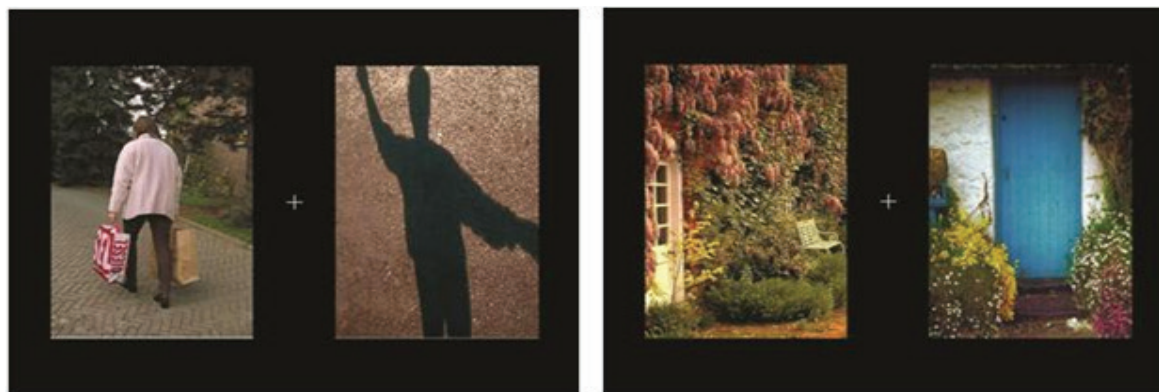
Figure 1. Two samples of study slides. (a): Painful-neutral; (b): Neutral-neutral

For the total number of fixations, there was a significant main effect of picture type ( F_{1,36}=69.47 , P<0.0001 , \eta^2=0.65 ) with most of fixations occurring on the painful images in both groups (painful: Mean=69.65, SD=15.99; neutral: Mean=47.76, SD=10.59). The main effect of group ( F_{1,36}=2.80 , P=0.1 ) and the group×stimuli interaction ( F_{1,36}=0.09 , P=0.76 ) were not significant. For duration of first fixations, there were no significant main effects for stimuli ( F_{1,36}=0.43 , P=0.51 ), group ( F_{1,36}=2.95 , P=0.09 ) and the interaction effect ( F_{1,36}=2.87 , P=0.09 ). Regarding the total duration of fixations there were no significant main effects for stimuli ( F_{1,36}=3.20 , P=0.08 , \eta^2=0.08 ), group ( F_{1,36}=0.614 , P=0.439 ) and the interaction effect ( F_{1,36}=0.635 , P=0.431 ).